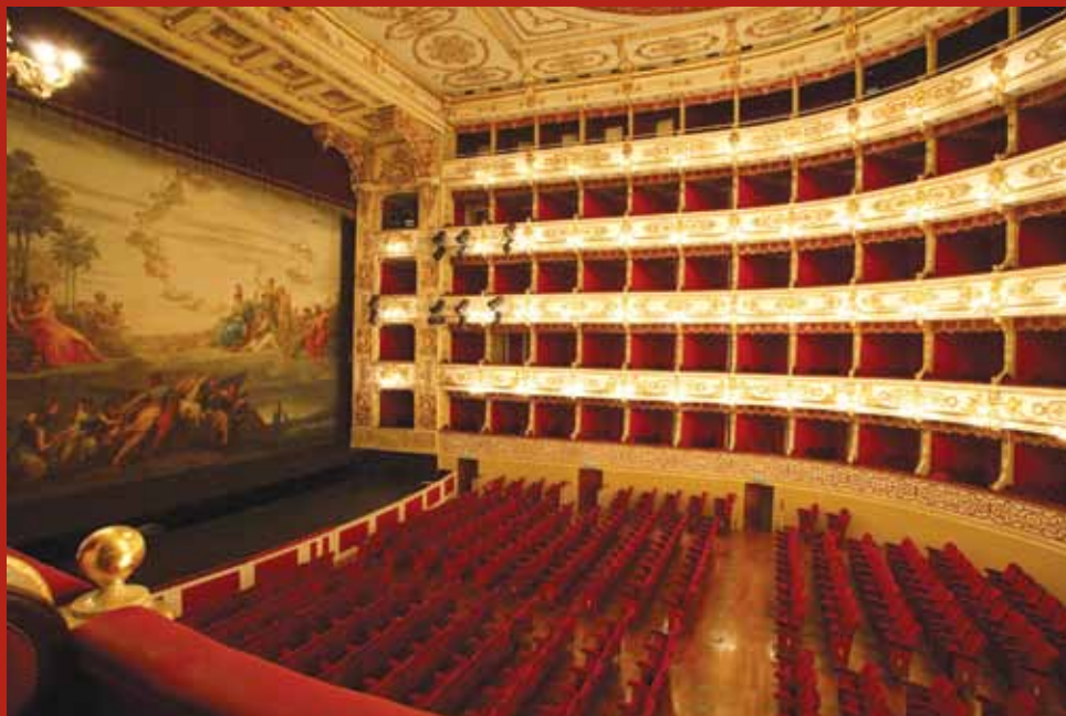
Interior of the Teatro Regio di Parma